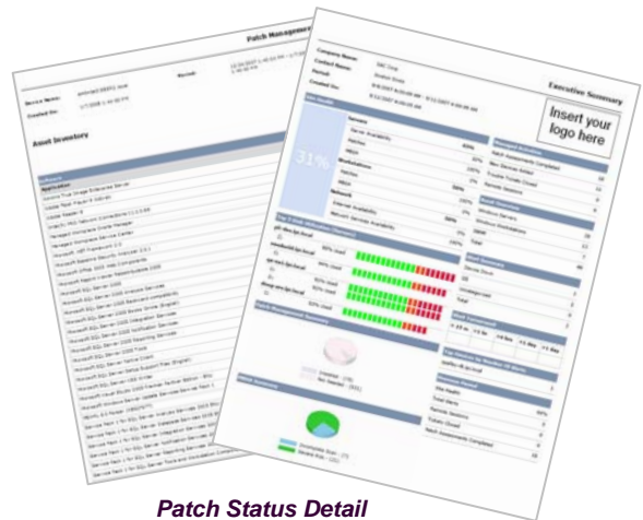
Patch Status Detail Server Health Report